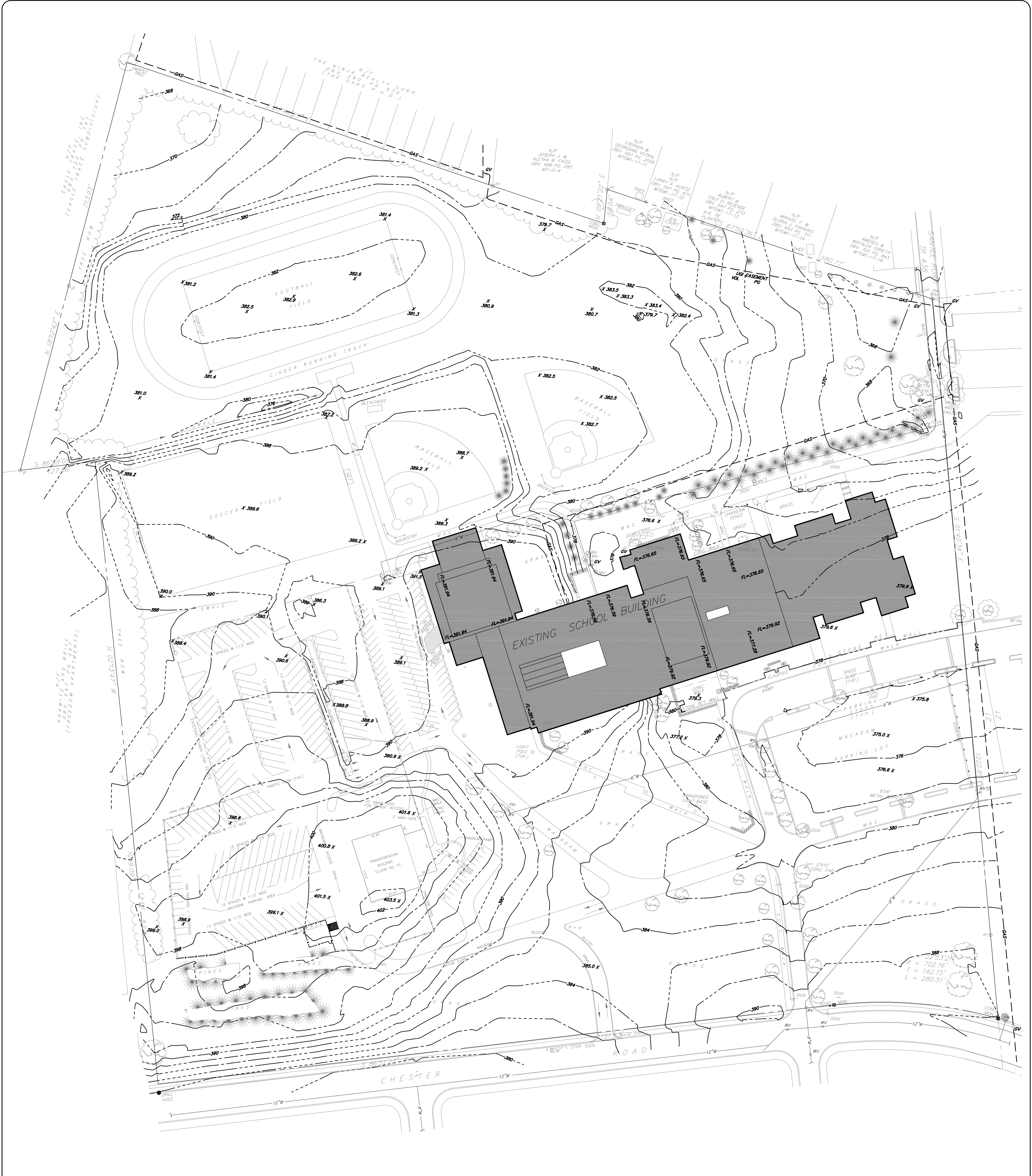
SITE PLAN SCALE: 1"=60'-0"